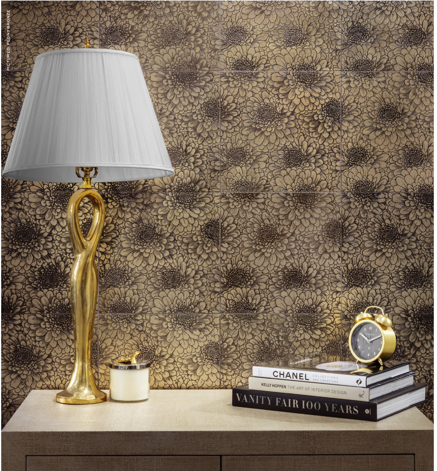
PICTURED: PEONY BRONZE

Chinese culture and Greek mythology revere Peonies as symbols of romance, prosperity, and good health. Inspired by their beauty, our Peony floral pattern is etched on marble through the Italian AquaForte technique, forming fine lines with luminous gold and bronze metallic highlights. Peony is available as 12" × 12" field tile, with the option of Gold etching on white marble or Bronze etching on grey marble.