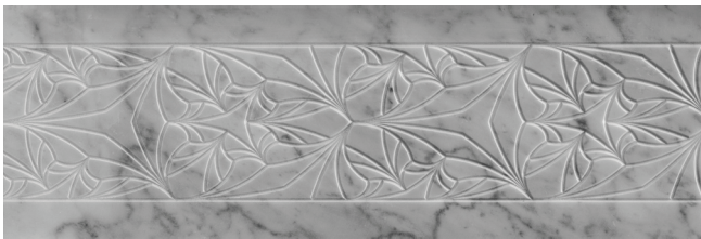
Decorative Field Tile Bianco Carrara - 7 3/4" x 23 5/8" x 5/8"