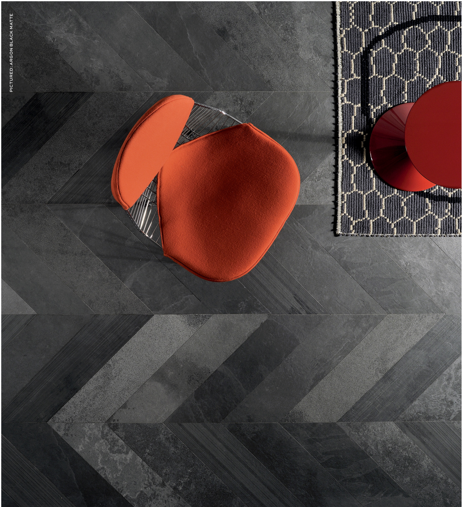
PICTURED: ARGON BLACK MATTE

The Argon Collection combines a random mix of chevron field tiles to create a stone-effect porcelain stoneware with a slick textured pattern. Light and shadow, smooth and rough combine to create a dynamic surface with a sophisticated, modern feel.