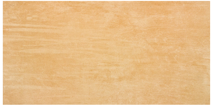
Beige Stroke - Special Order Only