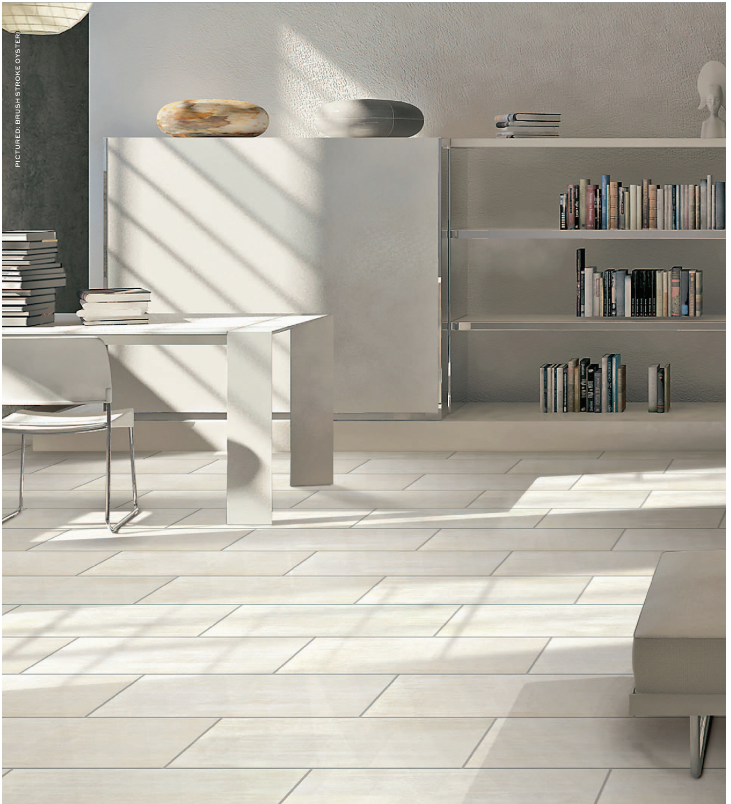
PICTURED: BRUSH STROKE OYSTER

Subtle Brush Marks dance across your floor. This new porcelain collection in five contemporary colors will bring a designer's flair to any space.