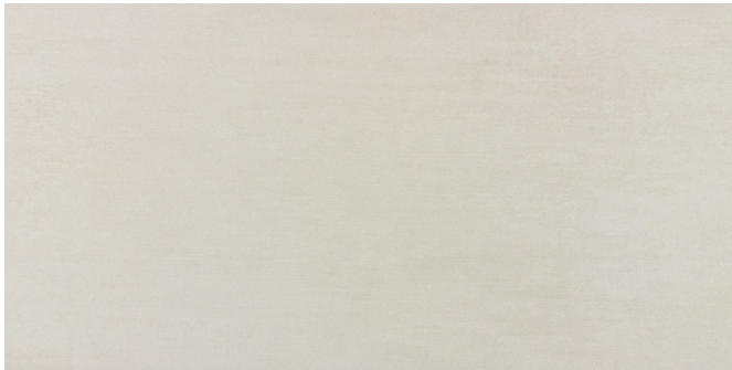
Oyster Stroke 4