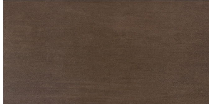
Walnut Stroke - Special Order Only