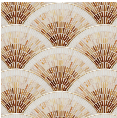
Cream Ombre with Solid Brass Metal Inlay - Mixed Finish