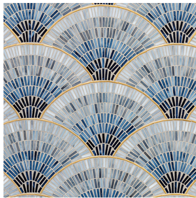
Blue Ombre with Solid Brass Metal Inlay - Mixed Finish