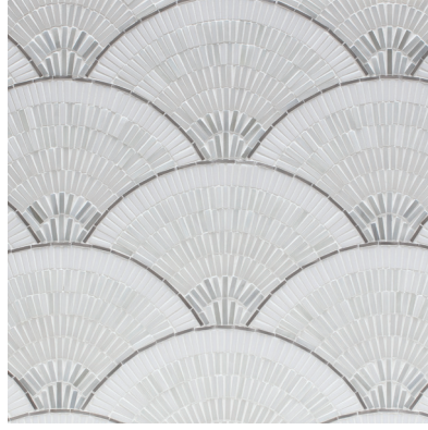
White Ombre with Stainless steel Metal Inlay - Mixed Finish