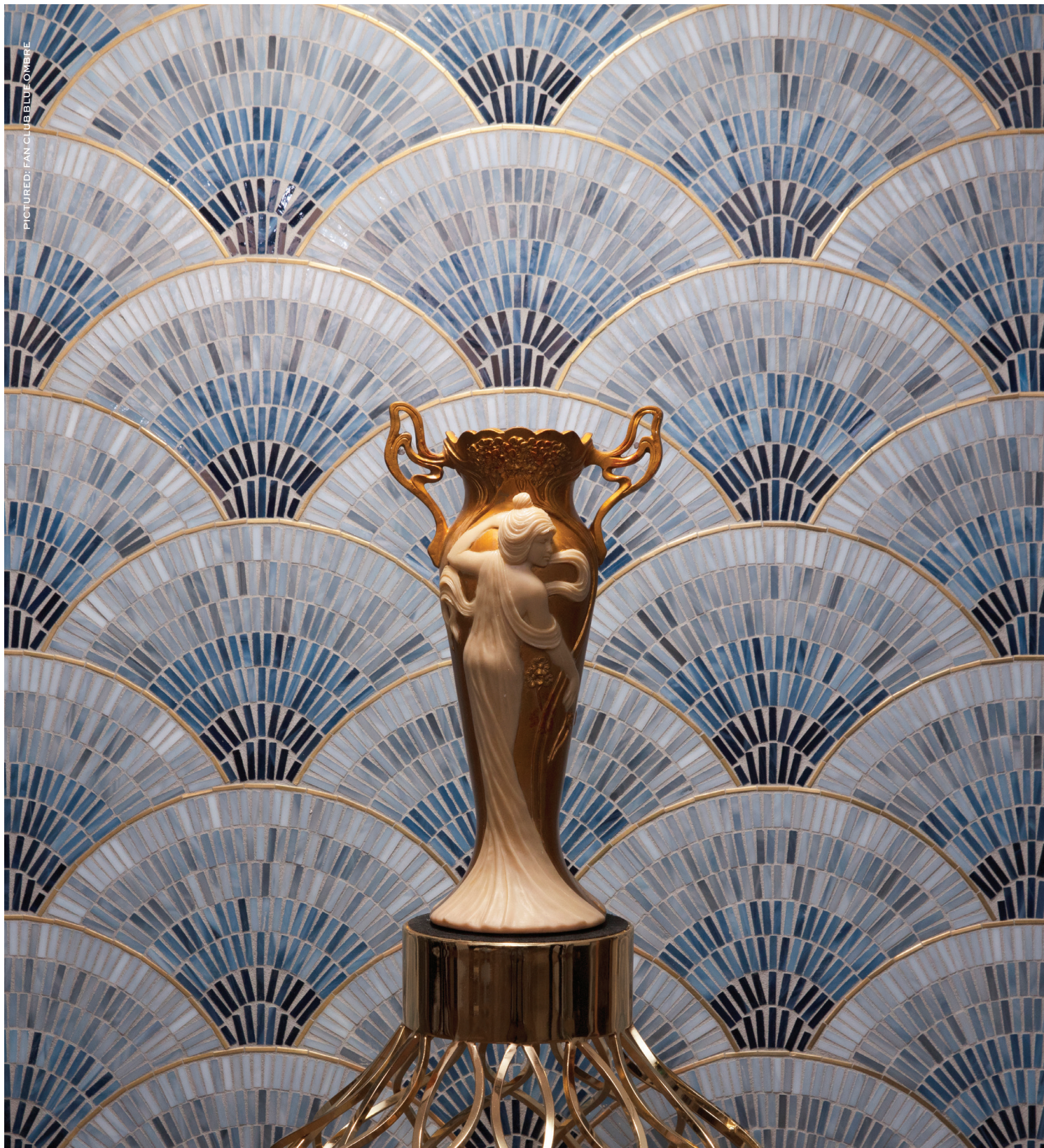
PICTURED: FAN CLUB BLUE OMBRE

Fan Club takes a pattern from antiquity and forges it from dazzling Jazz Glass, adding an artistic glass mosaic flair to a familiar motif. Stocked in solid Ice White, Blue Ombre with brushed brass, Cream Ombre with brushed brass, and White Ombre with Stainless Steel. The pattern in each colorway is truly special - tasteful, timeless, and thoroughly unique.