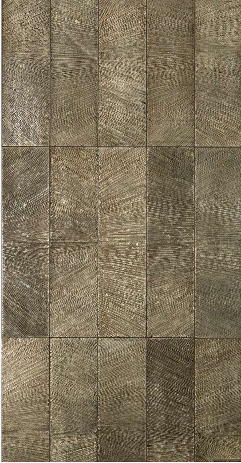
Antique Silver Polished