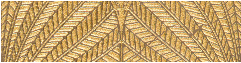
Heavy veining is inherent in this natural stone field tile