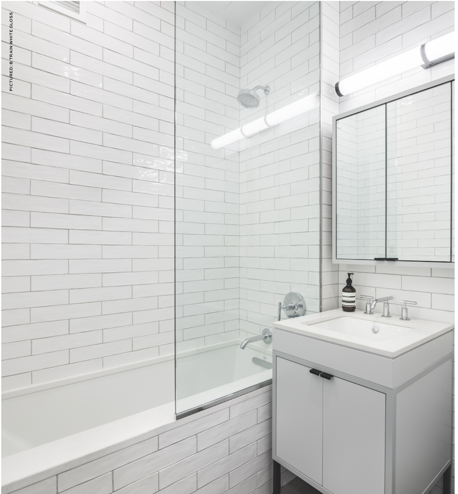
PICTURED: B TRAIN WHITE GLOSS

The Subway Collection combines two unique lines of ceramic subway tiles in a variety of rich colors and glazes. A Train is a traditional straight-edge ceramic tile, while B Train expands the category with a rustic-body and unfinished edges. Both lines work beautifully when used on their own, or pair perfectly with our most popular stone and glass tile collections.