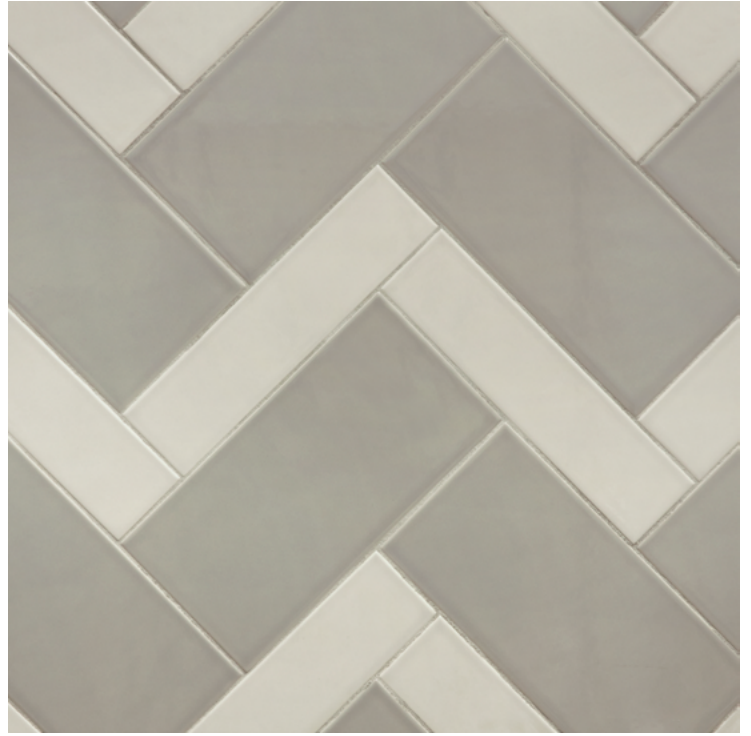
5" x 10" Ash Gloss & 2 1/2" x 10" Pearl Gloss