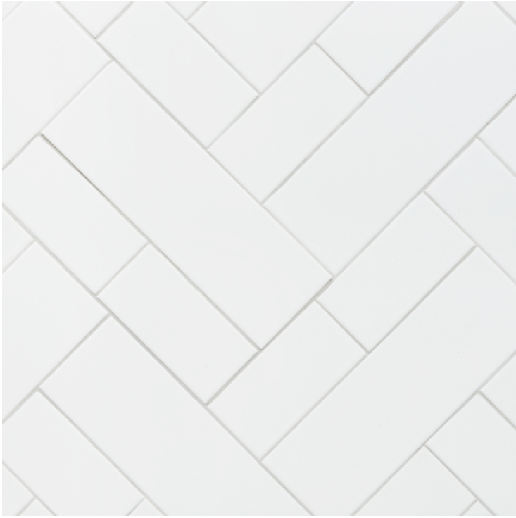
3" x 6" & 4" x 12" White Gloss