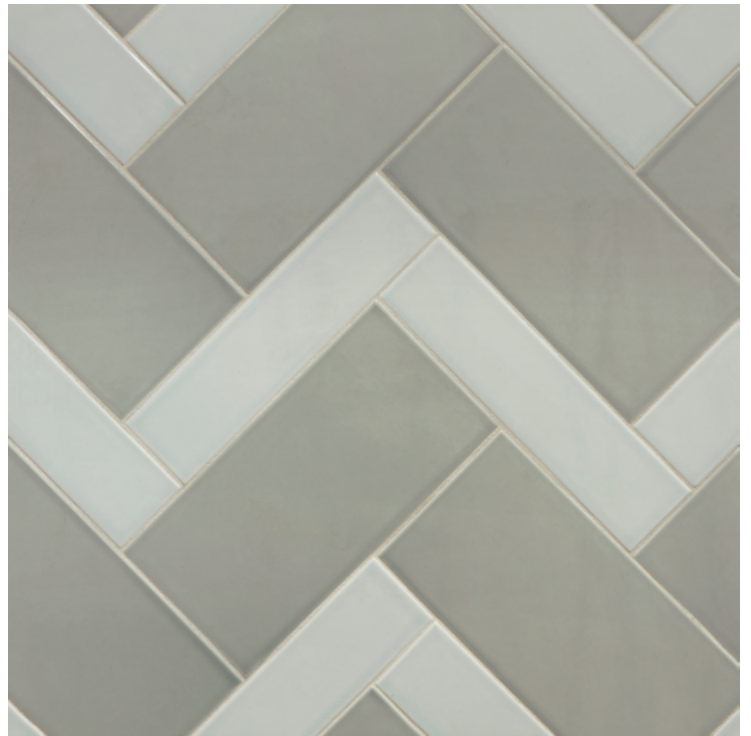
5" x 10" Grey Mist Gloss & 2 1/2" x 10" Azul Gloss