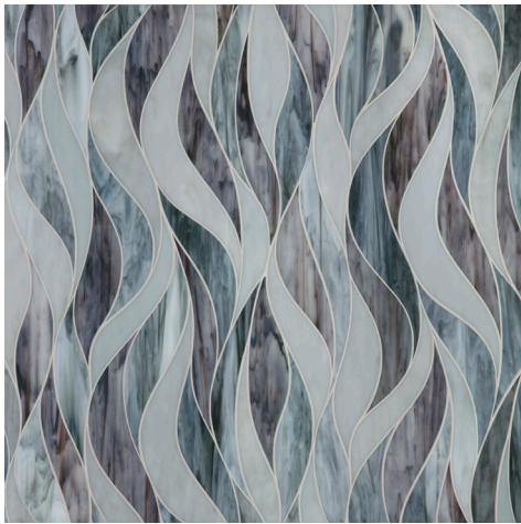
Blue Grey Gloss